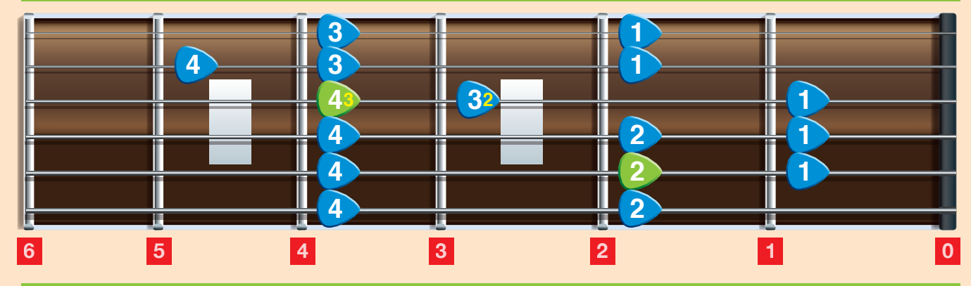
FOURTH POSITION PATTERN - Root note is A key signature is A Major